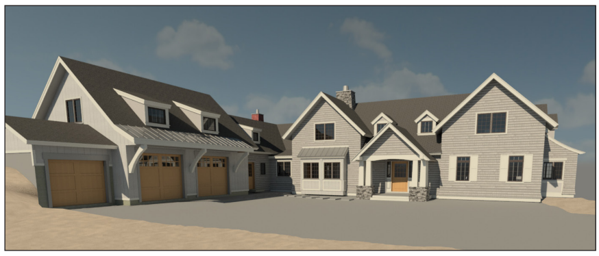
COURTYARD AND ENTRY

Materials include timber framed entry and awning, cedar shake and painted clapboard siding, stone and salvaged brick chimneys, and standing seam roofing.